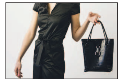
WE BUY: Purses & Accessories